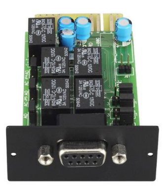
UPS Dry Contact Card VGL9901I