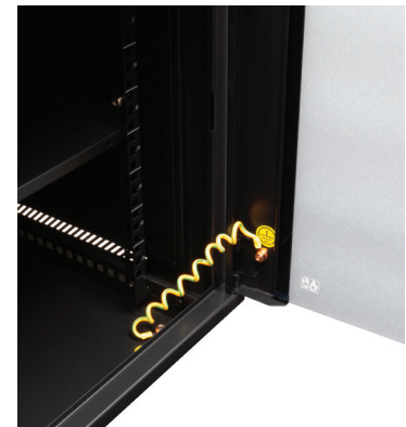
RWM9 Earth Wire