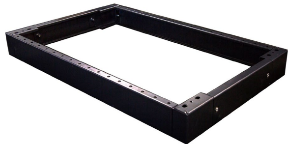
Optional plinth available to bolt cabinet to floor