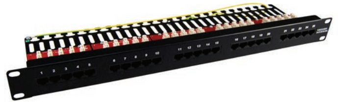
PP-25V2 - 25 Port

ISDN Category 3 patch panel is high-density telecommunication panel with 25 and 50 standard RJ45 jacks. The panel meets all latest standards and electrical parameters and is designed for termination of two pair cable on dual type 110/Krone termination blocks. Printed circuit board together with high quality components ensures the Category 3 performance. Integrated back cable management for separate cables provides organized and secure installation.