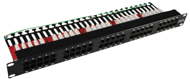
PP-50V2 - 50 Port