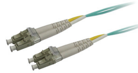
LC TO LC PATCH LEAD