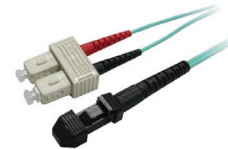
SC TO MT PATCH LEAD