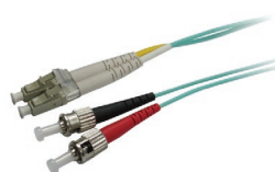
LC TO ST PATCH LEAD