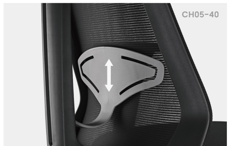
Height Adjustable Lumbar Support provides individualized comfort & helps promote a healthier sitting posture