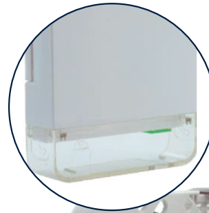
Clear Plastic Cover

The compact termination box supplied by DYNAMIX is designed to use in residential and business applications for the termination of up to 4x fibres. This wall box enables the installation of either a single Sirocco Blown Tube cable using up to a 2x fibres blown unit or two 2x fibres rugged cables to be spliced to 2x SC pigtails (PC or APC), which connect to adapters at the base of the unit. This box is supplied with a transparent plastic cover on the front adaptor side, providing major protection to the installed fibres. The unit can be quickly installed within an office, house or communication room environment.